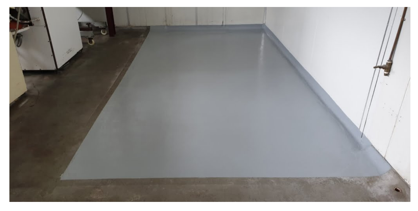
Believe me, we have got you covered.