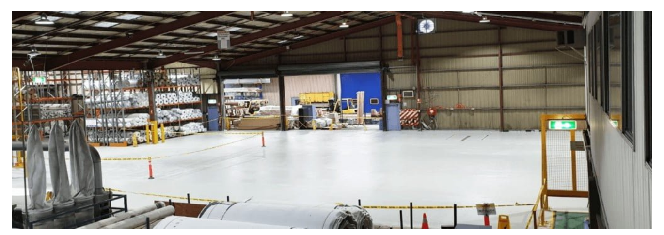
Industrial Epoxy Flooring and Coating finish by Epoxy Flooring Brisbane

Epoxy Flooring Brisbane: we have been delivering Quality Service for over 25 years